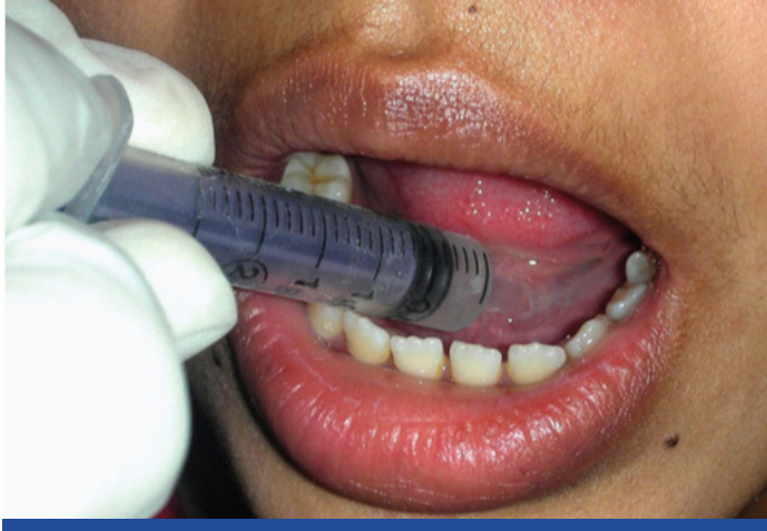
[Table/Fig-2]: Method of collecting saliva from floor of the mouth

[Table/Fig-1]: Glucometer with evaluation strips